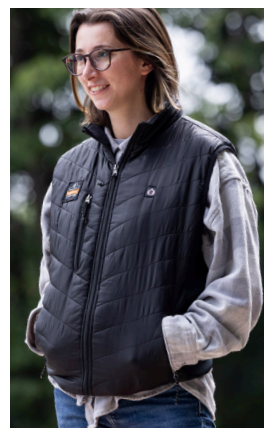
6495 RECHARGEABLE HEATED VEST W/ BATTERY POWER BANK