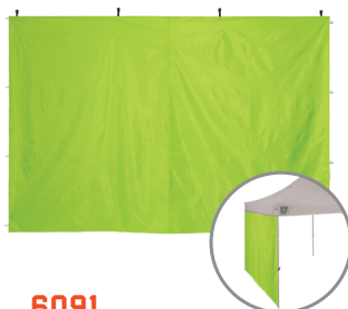
6091 10' POP-UP TENT SIDEWALL - 10FT X 20FT TENT