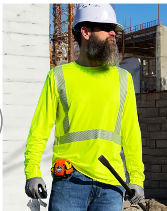
6688 COOLING HI-VIS SUN SHIRT WITH UV PROTECTION - TYPE R, CLASS 2