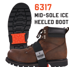
6317 MID-SOLE ICE CLEATS - HEELED BOOT