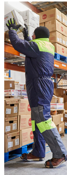
6475 INSULATED FREEZER COVERALLS