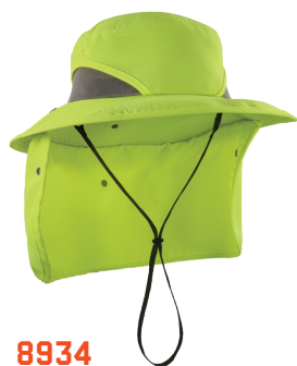
8934 RANGER HAT WITH NECK SHADE