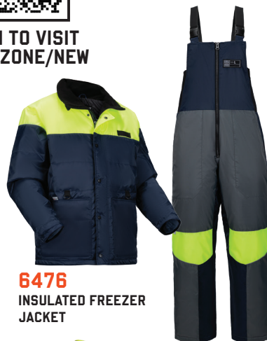
6476 INSULATED FREEZER JACKET