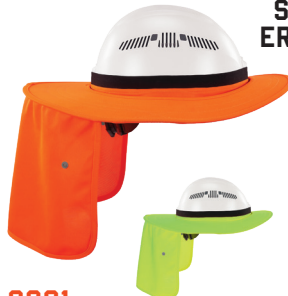
6661 UNIVERSAL HARD HAT BRIM WITH NECK SHADE