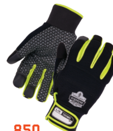
850 INSULATED FREEZER GLOVES