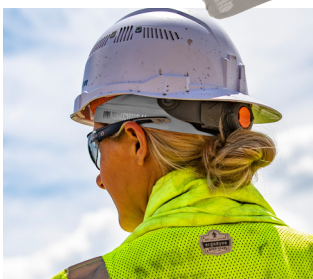
6632 (GRAY COLOR ADD) COOLING SKULL CAP - PERFORMANCE KNIT