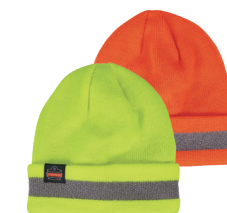
6803 REFLECTIVE RIB KNIT WINTER HAT