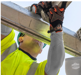
6690 (GRAY COLOR ADD) COOLING ARM SLEEVES - PERFORMANCE KNIT (PAIR)