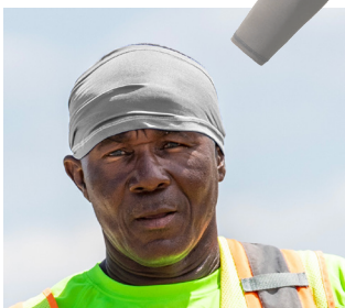
6634 (GRAY COLOR ADD) COOLING HEADBAND - PERFORMANCE KNIT