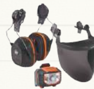
Hard Hat + Safety Helmet Accessories