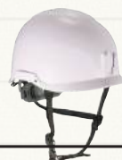
Safety Helmets, Type 1 + 2